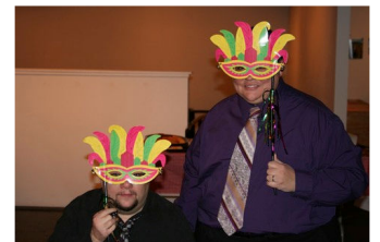
Volunteers in disguise